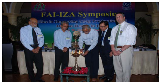
Lighting ceremony at the symposium

A panel of experts, including top government officials, also addressed India’s national fertilizer policies and zinc. A new initiative, which provides government support as part of the National Food Security program for the use of zinc in fertilizers, was discussed at the meeting as well.