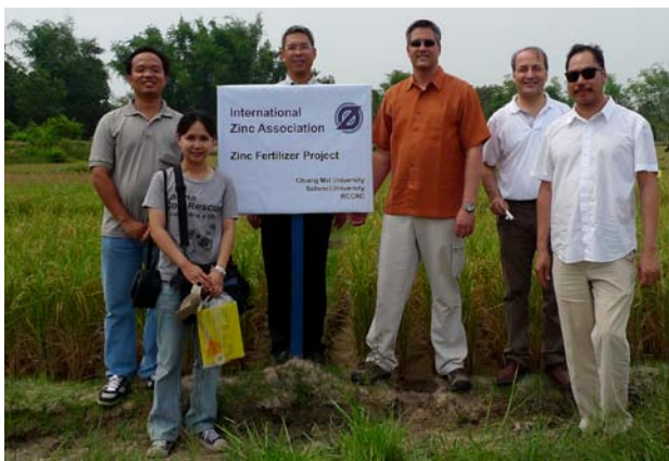
Demonstration field trial for rice in Laos