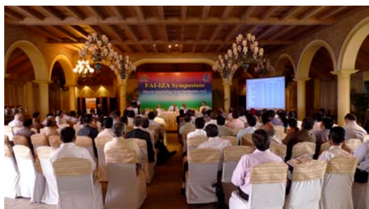
Participants at the symposium

On 28 April 2009, the Fertilizer Association of India (FAI) and IZA organized a symposium on zinc in improving crop production and human health in New Delhi, India. The symposium was attended by over 125 delegates representing the Indian government (e.g. Ministry of Agriculture), fertilizer companies/associations, zinc distributors/manufacturers and researchers.