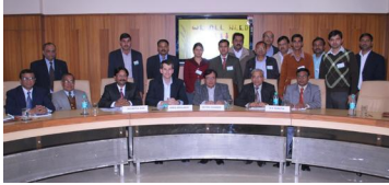
Training program group photo, FAI House, New Delhi in February 2011

These training programs have been well received by the participants. The participants feel that the program is very beneficial and have asked for more sessions to be held across India to further spread the message through industry.