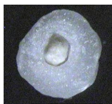
Urea particle containing 3% zinc core granule cross section

IFDC In 2011, IZA and the International Fertilizer Development Center (IFDC) signed an MOU to advance IFDC's zinc-rich technology. This technology involves substituting a micronutrient-