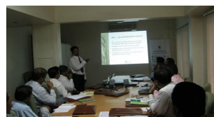
Training program session at Deepak Fertilizers & Petrochemical Corp., Pune in April 2011

In 2010, IZA launched the Zinc Fertilizer Training Program in India, with the objective of generating increased awareness and knowledge about addressing zinc deficiency in soils, crops and humans through use of zinc fertilizers. About 50% of Indian soils are deficient in zinc, which impacts crop productivity and adversely affects human health.