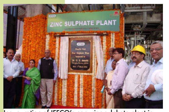
Inauguration of IFFCO's new zinc sulphate plant in Kandla Port in west India, March 1, 2012

The new zinc sulphate monohydrate plant at IFFCO's Kandla complex in Gujarat state is expected to be India's largest, with the capacity to produce 100 tonnes