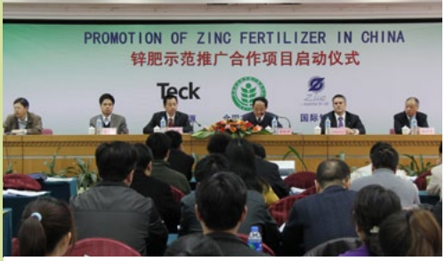
IZA-MoA Workshop in Xiamen, March 7, 2012

China, which is very important to correct zinc deficiency in Chinese crop production, and improve fertilizer application technology and efficiency."