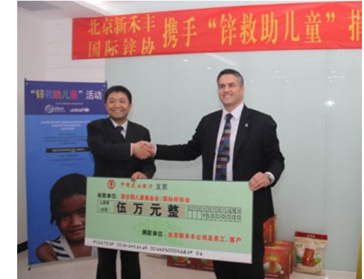
Donation ceremony at Xinhefeng, March 9, 2012

Xinhefeng is a major micronutrient fertilizer producer and retailer in China and has been a member of ZNI since 2010.